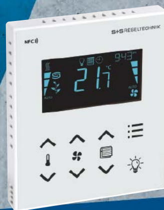
RYMASKON® 262-Modbus, white, for temperature, ventilation, sun screens, lights and menu