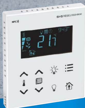
RYMASKON® 242-Modbus, white, with keys for temperature, sun screens, lights, room occupancy and menu