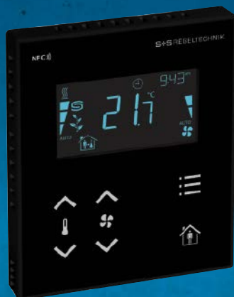
RYMASKON® 221-Modbus, black, with keys for temperature, ventilation, room occupancy and menu