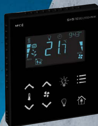
RYMASKON® 231-Modbus, black, with keys for temperature, ventilation, lights, room occupancy and menu