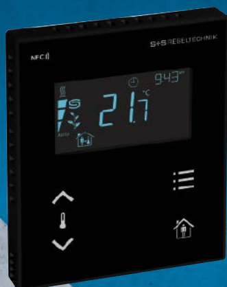
RYMASKON® 211-Modbus, black, with keys for temperature, room occupancy and menu