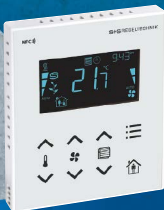
RYMASKON® 252-Modbus, white, with keys for temperature, ventilation, sun screens, room occupancy and menu