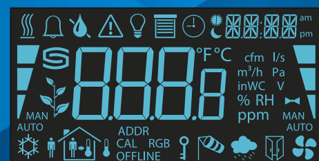
Display symbols RYMASKON® 200-Modbus

The compact housing features a glass front panel in stylish black or white high-gloss finish. International icons facilitate the operation and menu guided configuration of the device. The backlight color and brightness of the multi-function display can be adapted to the room design. A special cleaning mode prevents accidental changes of settings.